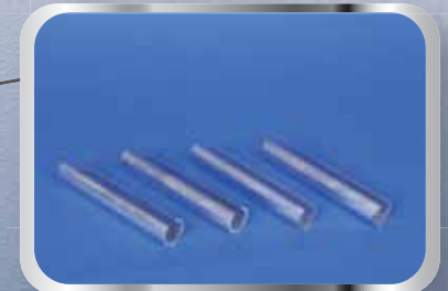
6007 - Straight Joiner