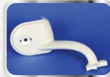
6013 - 90° Inside Corner Bracket Kit (Not shown)