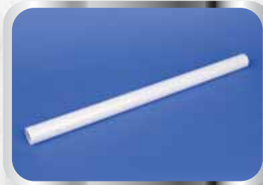
6000 - 104" Rail w/ Stiffener