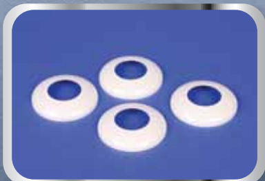
6011 - Bracket Wall Return Cover Plate (Not shown)