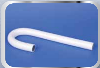
6006 - Post Return (Not shown)