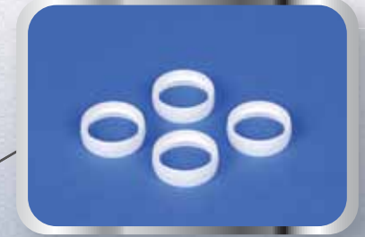
6009 - Joint Ring