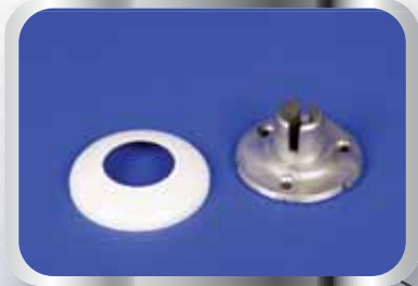
6002 - Straight Wall Return Kit