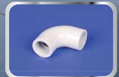
6004 - 90° Corner