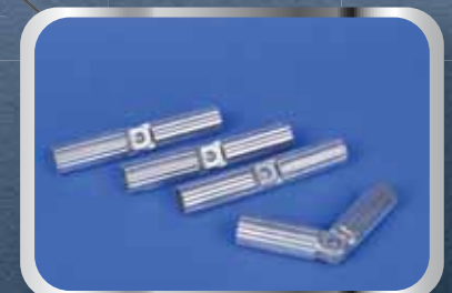
6008 - Adjustable Joiner