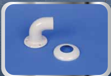
6001 - Wall Return Kit