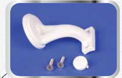
6003 - Handrail Bracket Kit