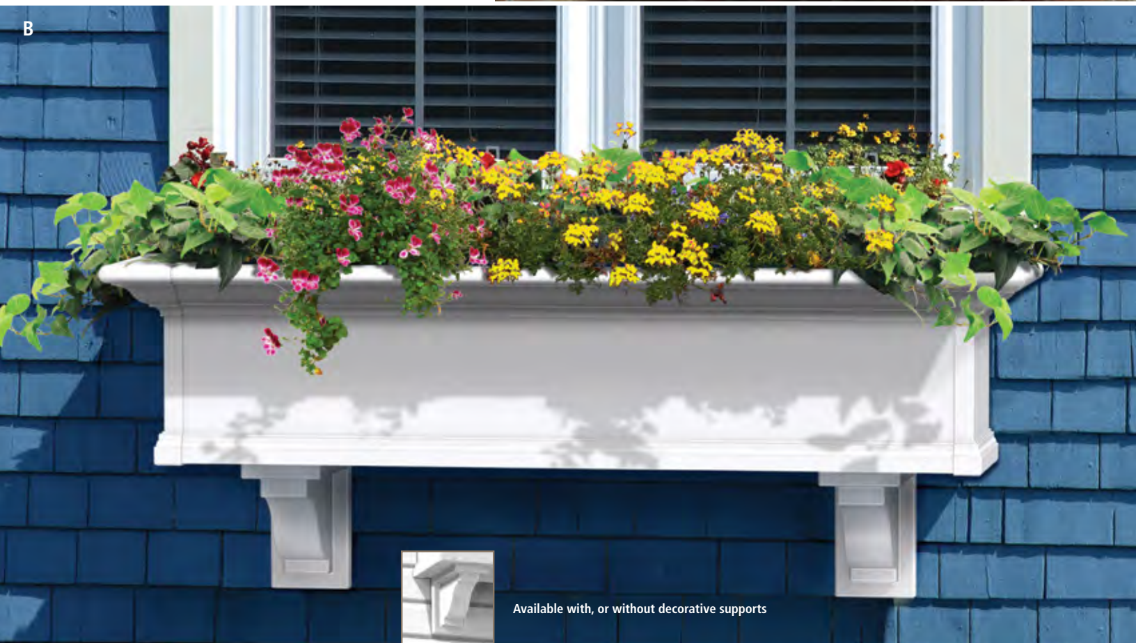
Available with, or without decorative supports